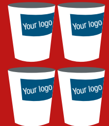
TABLE WINE SPONSOR