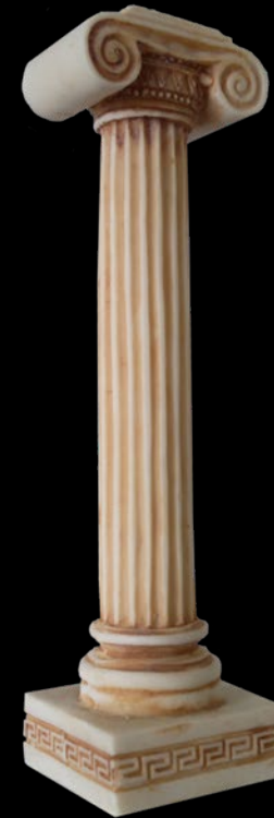
2 Feet In !